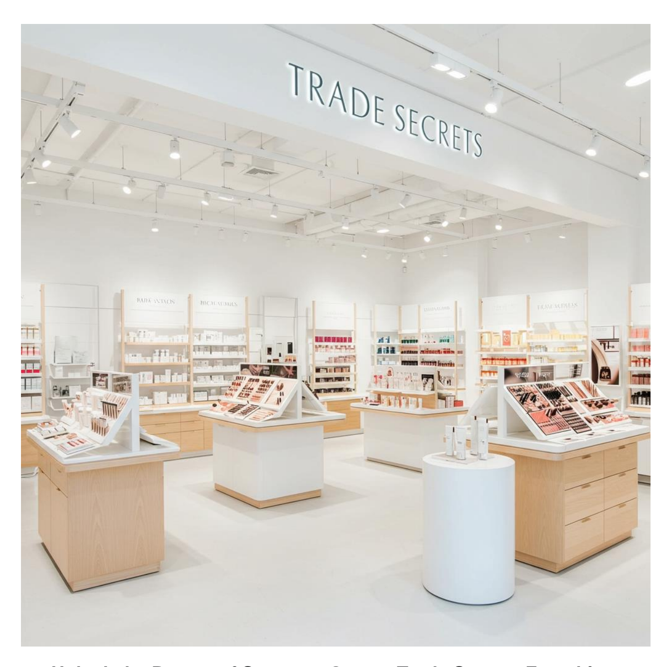
Unlock the Beauty of Success: Open a Trade Secrets Franchise